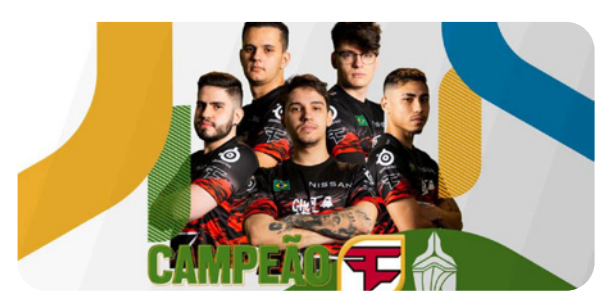
Rainbow Six Team / FaZe Clan's Rainbow Six team won the Stage 2 Elite Six Cup (Copa Elite Six) - 2022.