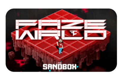
THE SANDBOX / September 15, 2022: Partnered with The Sandbox in inaugural entry to the metaverse, opening the door to a gamified FaZe World that allows users to experience and engage with FaZe Clan and FaZe talent.