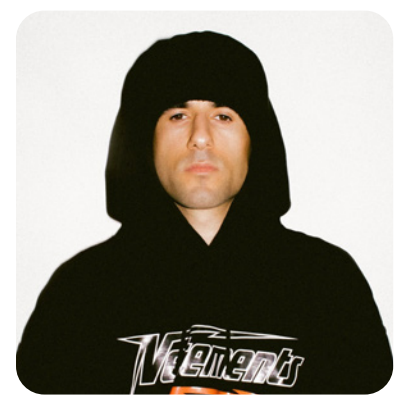
FaZe Kaysan / FaZe Kaysan released three new tracks in under a year (MVP, Plenty, Black Ops) collectively amassing over 58.2M streams across Spotify (22.7M), YouTube (16.6M), Apple Music (15.6M), SoundCloud (3.3M)