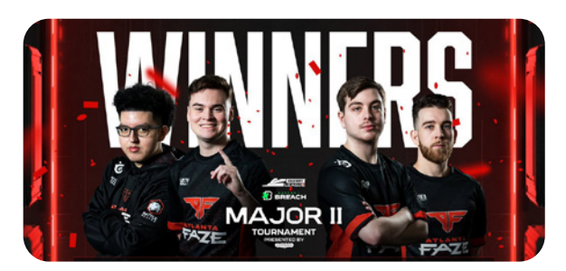
Atlanta Faze Team / In 2023, FaZe Clan's Call of Duty League esports team, Atlanta FaZe , won Call of Duty Major II in Boston.