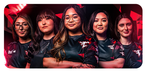
Valorant Team / FaZe Clan Signs Organization's First All Female Professional Esports Team to Compete in VALORANT Game Changers Series - March 7, 2023.