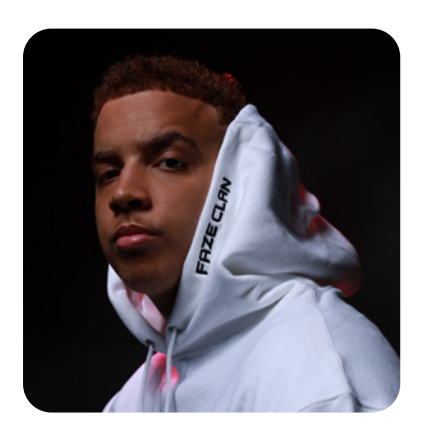
FaZe Swagg / FaZe Swagg announced a landmark streaming deal moving exclusively to YouTube (announced <u>September 1, 2022</u>) and signed a deal with Klutch Sports as the first gamer ever to be represented by the agency (announced <u>May 12, 2022</u>)